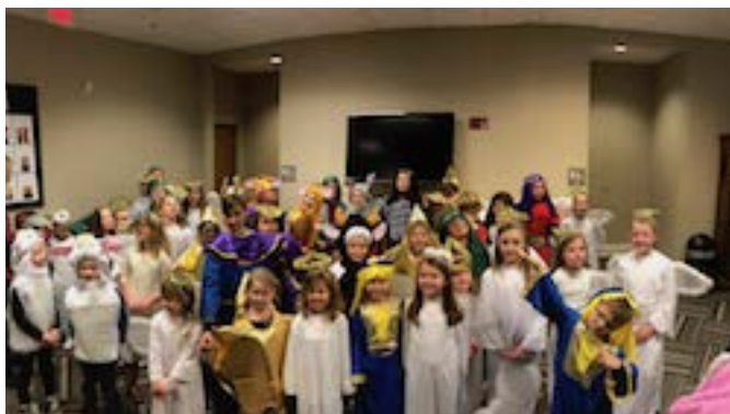
Children's Christmas Program and Living Nativity

Missions Focus for January: Collecting diapers and wipes for Hope Haven, making bird feeders/houses for our feathered friends