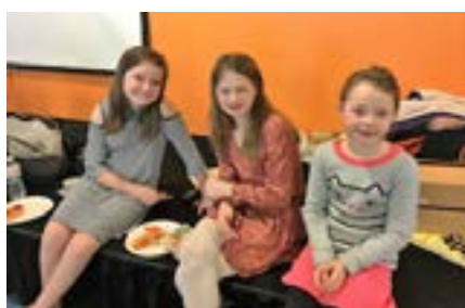
Family Lenten Lunch

Memory Verse: "God loved the world so much that He gave His only Son." John 3:16, GNT